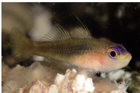
Fig. 4. Trimma imaii , live, KPM-NR 89686, north of Izu-ohshima Island, the Izu Islands, Japan, 50m depth, photo by H. Onuma.

except as follows: background color of head and body bright greenish yellow; middle of body light gray to grayish-brown; scales pockets on body (except belly) with greenish-gray margins; snout, interorbit, margin of eye, and upper and lower parts of eye strong blue; iris bright yellow; middle of caudal fin bright yellow without round blotches.