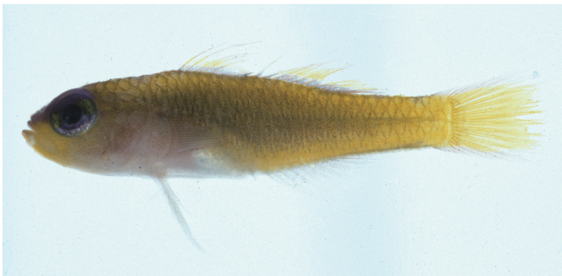
Fig. 2. Trimma imaii , fresh specimen, KPM-NI 4252, female, holotype, 17.6 mm SL, north of Izu-ohshima Island, the Izu Islands, Japan, 55 m depth, photo by H. Senou.