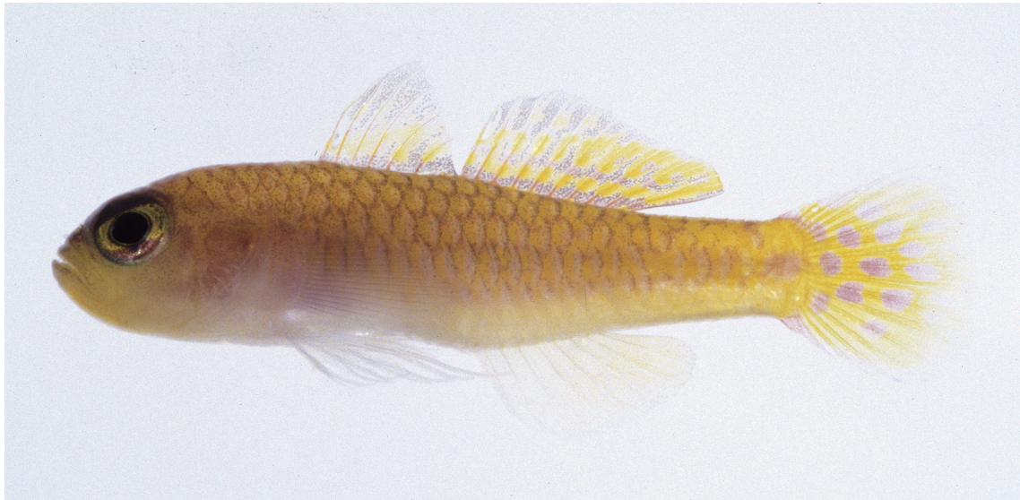
Fig. 6. Trimma caudipunctatum , fresh specimen, KPM-NI 13301, male, holotype, 20.9 mm SL, Kume-jima Island, Okinawa Islands, the Ryukyu Islands, Japan, 70 m depth, photo by H. Senou.