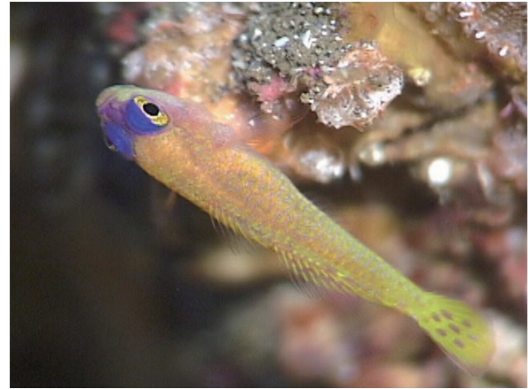
Fig. 8. Trimma caudipunctatum , live, KPM-NR 66322, Tsutomezaki, Kashiwa-jima Island, Shikoku, Japan, 40 m depth.

part of upper jaw. Lower jaw with outermost row of four enlarged, spaced teeth; two irregular inner rows of small teeth, grading to single posterior row of small teeth; a single innermost row of medium-sized, slightly spaced teeth.