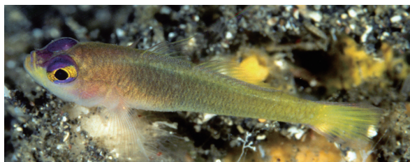
Fig. 3. Trimma imaii , live, KPM-NR 89368, north of Izu-ohshima Island, the Izu Islands, Japan, 53m depth, photo by H. Onuma.

Color when alive (Figs. 3 & 4). Similar to fresh coloration,