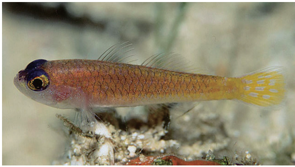
Fig. 7. Trimma caudipunctatum , live, KPM-NR 80806, Seragaki, Okinawa-jima Island, Okinawa Islands, the Ryukyu Islands, Japan, 50m depth, photo by Y. Miyamoto.